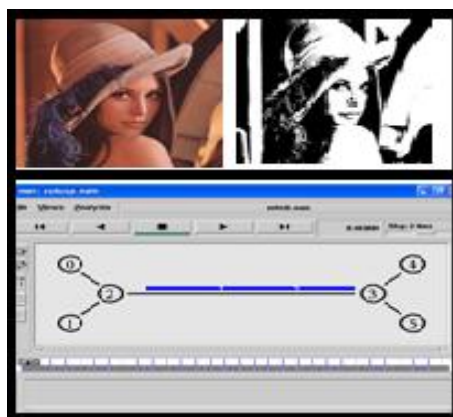
Fig.1. Black and white image compression and UDP transmission.

Initially image is converted into binary using matlab coding. This image is further packetized and sent to nodes. The image conversion in matlab is shown below: